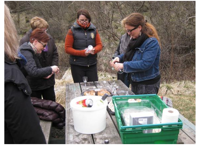
Participants from Akureyri and surroundings enjoying a picnic on the way to Ísafjörður. The temperature is about 4°C