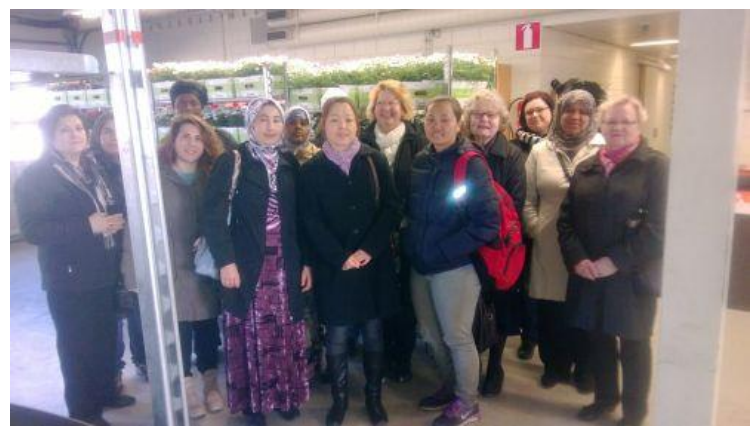
Group of Daisy Ladies visiting Vocational School Institute Livia in Kaarina town Finland. After the visit in Livia we were served in lunch by a lady from Tunisia

immigrant women in their efforts to adapt themselves to new circumstances in Finnish society. The association needs volunteer workers to run its programme because it is only partly financed by public funds. Five retired Gamma members were willing to participate in the programme. We considered it a challenging and inspiring task. It suited us well since we all had a long teaching experience and enough time to do volunteer work.