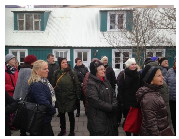
"History walk" in Ísafjörður

The very last item on the agenda was the Conference banquet at Tjöruhúsið where we had a wonderful meal and enjoyed the company of each other as well as some entertainment.