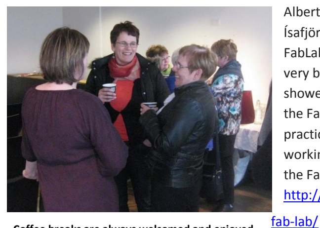
Coffee breaks are always welcomed and enjoyed

to hear how things were organized, followed by a lot of work for the students and how the students sorted everything out at the end. It will be interesting to follow the development of this project in the future.